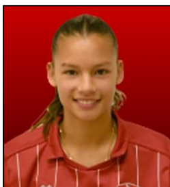
UNA LUE Available to Sponsor