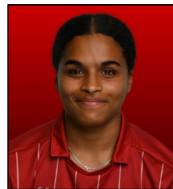
HENNA BUTCHER Available to Sponsor