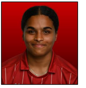
HENNA BUTCHER Available to Sponsor