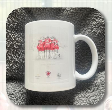
CTLFC Mug £6.50