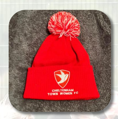
CTLFC Hat £13.50