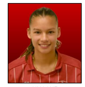
UNA LUE Available to Sponsor