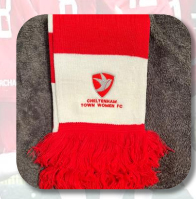
CTLFC Scarf £13.50