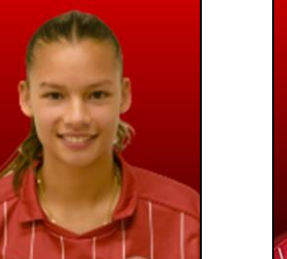
UNA LUE Available to Sponsor