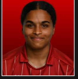
HENNA BUTCHER Available to Sponsor