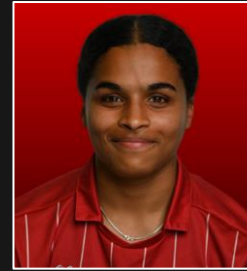
HENNA BUTCHER Available to Sponsor