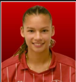
UNA LUE Available to Sponsor