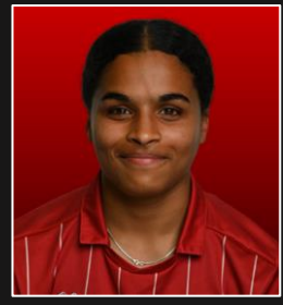
HENNA BUTCHER Available to Sponsor